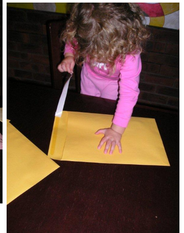
... and helping to package the AGM documents