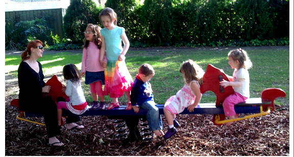
Friendships extend beyond the playgroup

Eleven year ten students from All Saints College have recently prepared a new mural on the inside of Underpass A. Their involvement is the result of the Helping Hands Program run through the school each year to allow students the opportunity to be involved in community service.