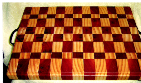
End-grain Cutting Boards