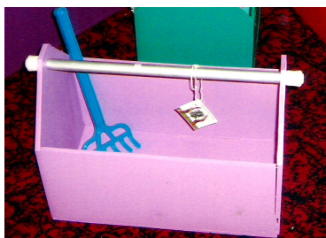
Versatile Carry Crates