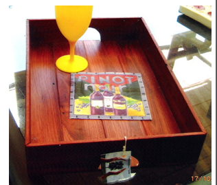
Jarrah & Pine Trays

Perfect for your home. Perfect as GIFTS anytime!! Treat yourself and your friends to something homemade locally.